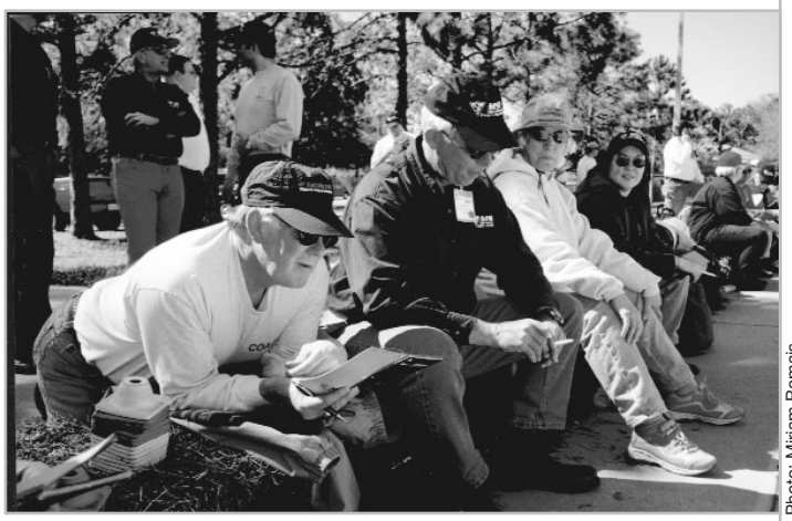
SC: If someone were to observe one of your classes, what would they see?

turn the responsibility for learning during the course and riding safely after the course over to the students. My friends always thought I'd be a good teacher, but I think it's more about being a good communicator. I had a few crummy teachers, and I still see some as I continue to enroll in professional development opportunities. I think my constant-learning attitude makes me open to better understand how others learn and what they go through in learning a new skill such as motorcycling.